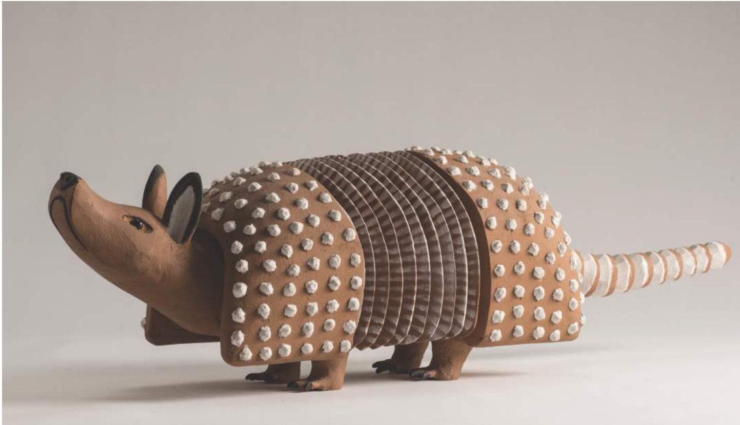
Leroy Archuleta (born 1949). Untitled (Armadillo) , 1989. Wood carving, paint, glass. 12 x 50 x 12 in.