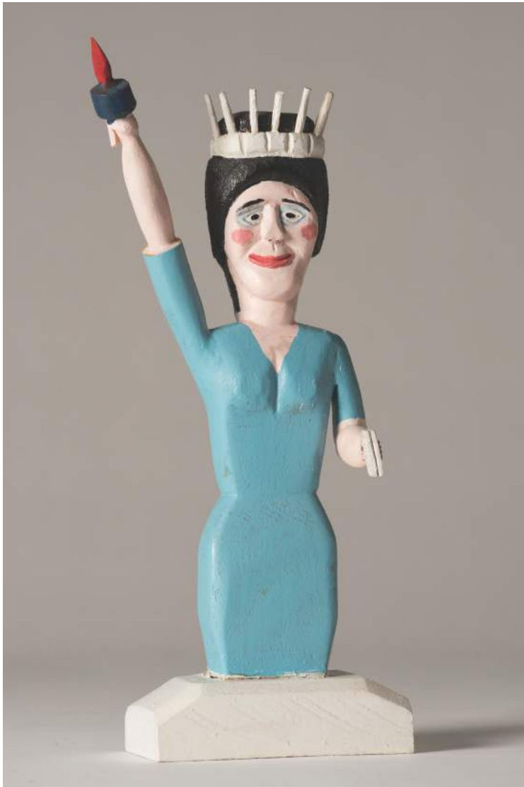
George Williams (born 1910; died 1997). Untitled (Statue of Liberty) , circa 1990 – 1997. Wood carving, paint. 20 x 9 1/2 x 5 3/4 in.