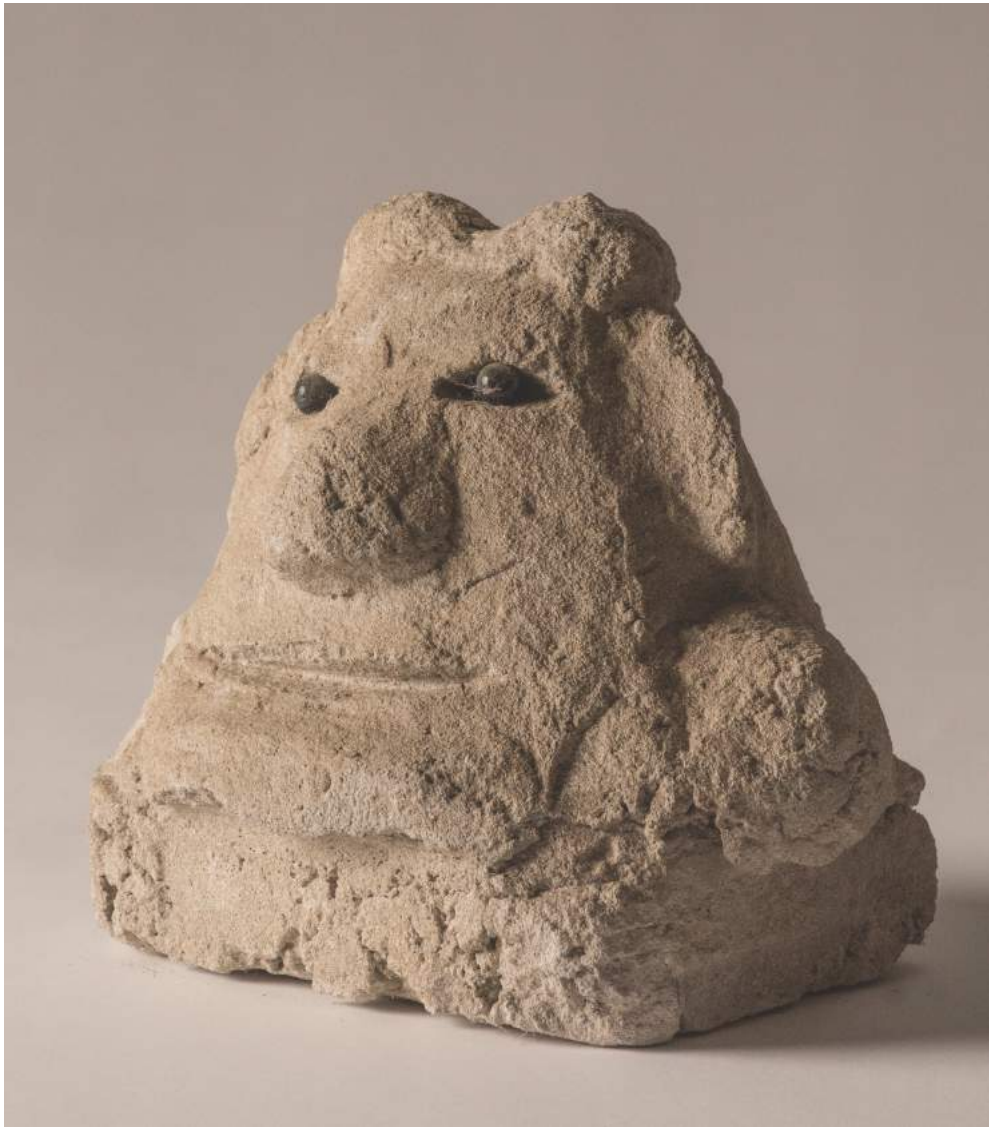
Burgess Dulaney (born 1914; died 2001). Untitled , circa 1990 – 1999. Concrete, glass.