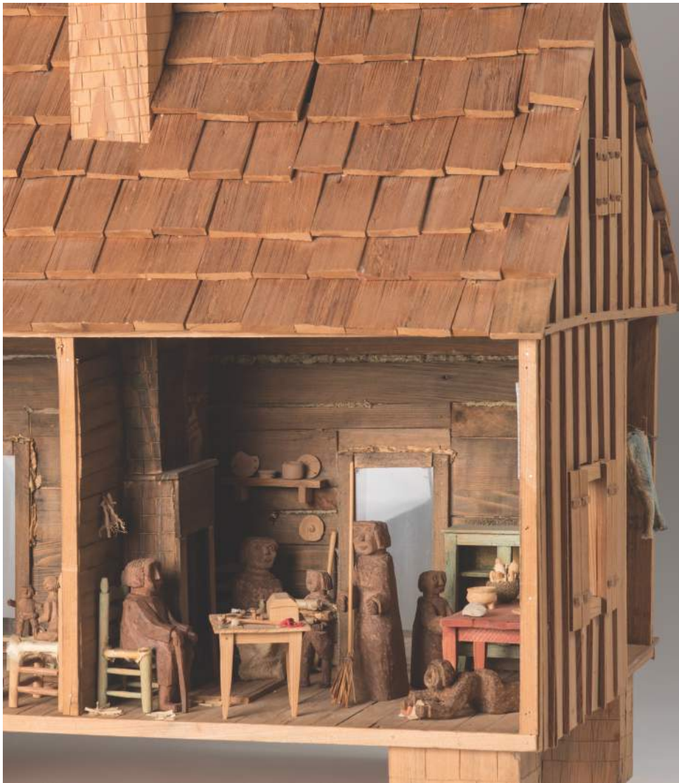
Rita Fontenot (born 1946, died 2003). Untitled (Creole Cottage) , 1993. Natural and stained wood, wood glue, steel, acrylic sheeting, leather raw cotton, spanish moss, leather, feathers, corn husks, plant fibers, natural fiber woven textiles, copper, jewelry wire, pelt, newspaper, mirror, clay, polymer clay, metal nails, tooth. 353/4 x 313/4 x 23 in.