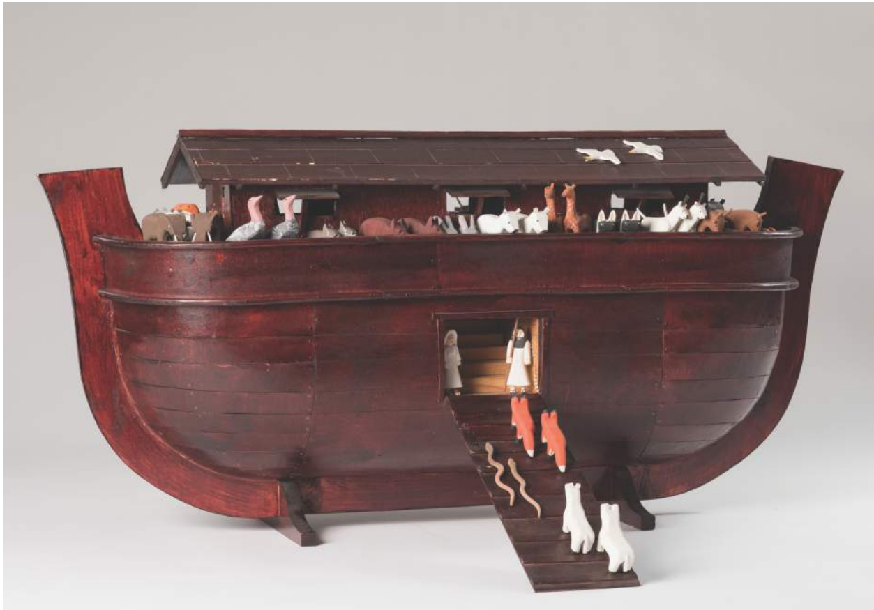
Ivy Billiot (born 1945). Untitled (Noah's Ark) , circa 2010. Carved and stained wood, paint, metal chain, leather. 22 x 43 x 14 in.