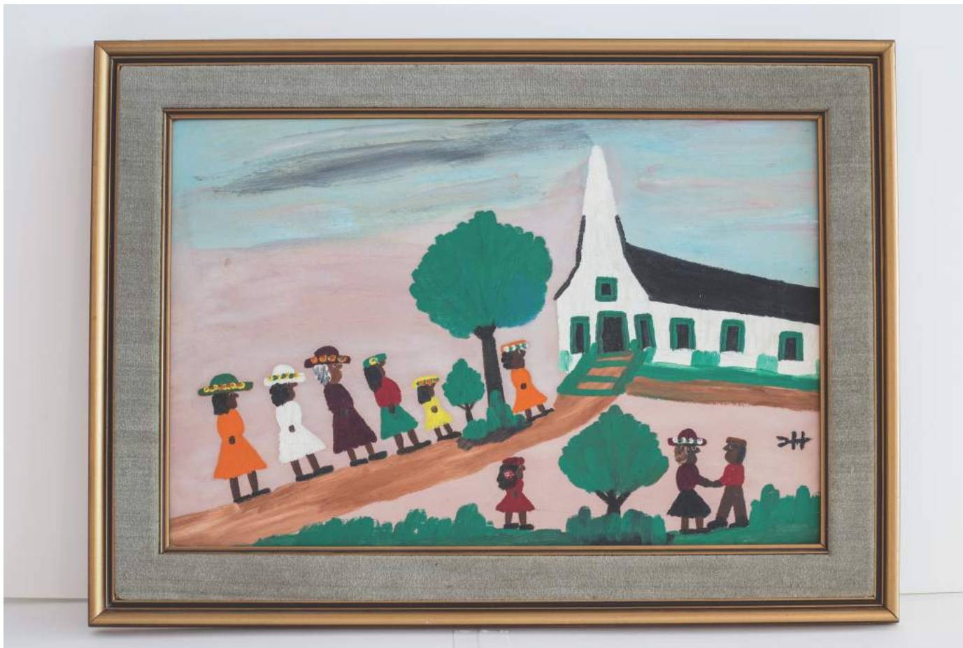
Clementine Hunter (born 1886; died 1988). Church Scene , circa 1970 – 1988. Oil on paper board. 18 x 24 in.