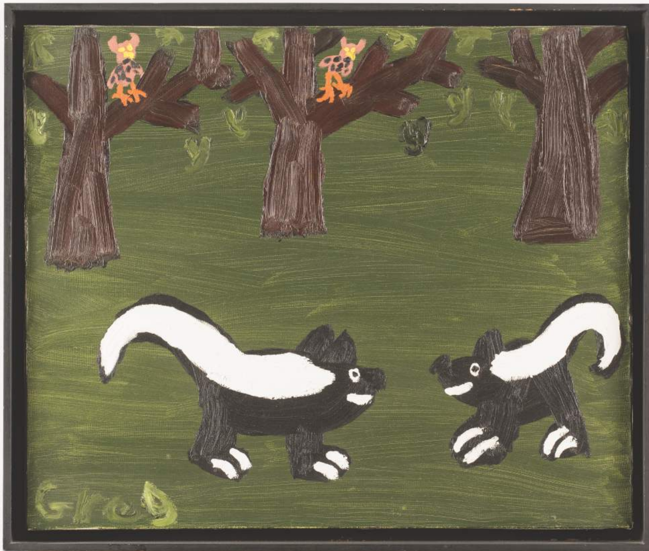
Greg Pelner (born 1968). Untitled (Skunks) , date unknown. Acrylic on canvas. 22 x 25 1/2 in.