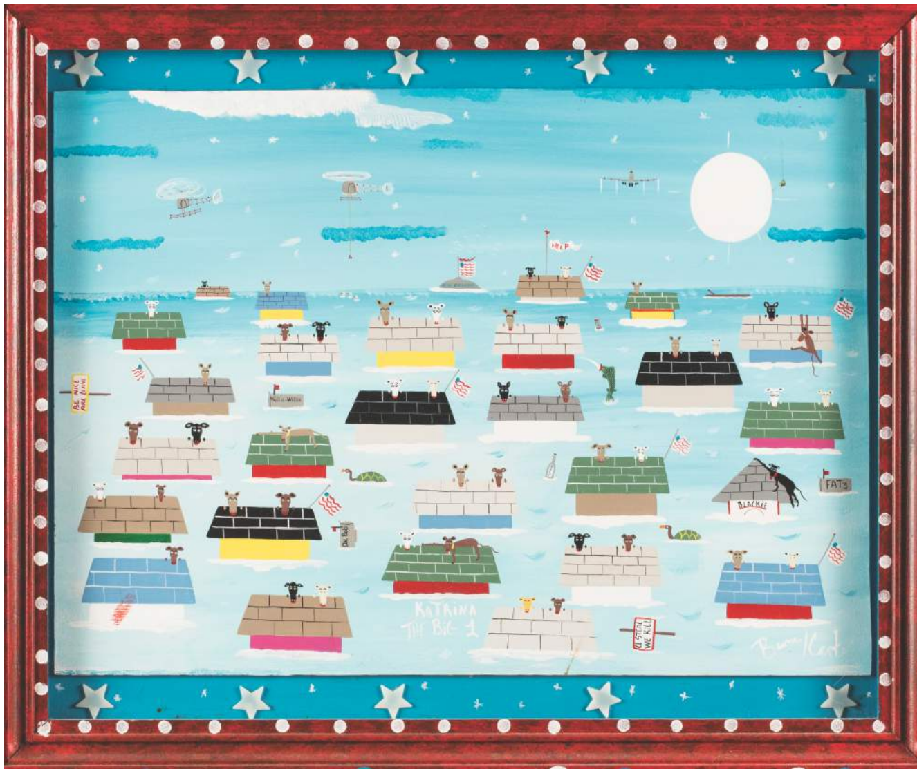
Benny Carter (born 1943; died 2014). Katrina the Big 1 , circa 2000 – 2009. Paint on board with handpainted frame. 24 1/2 x 29 in.