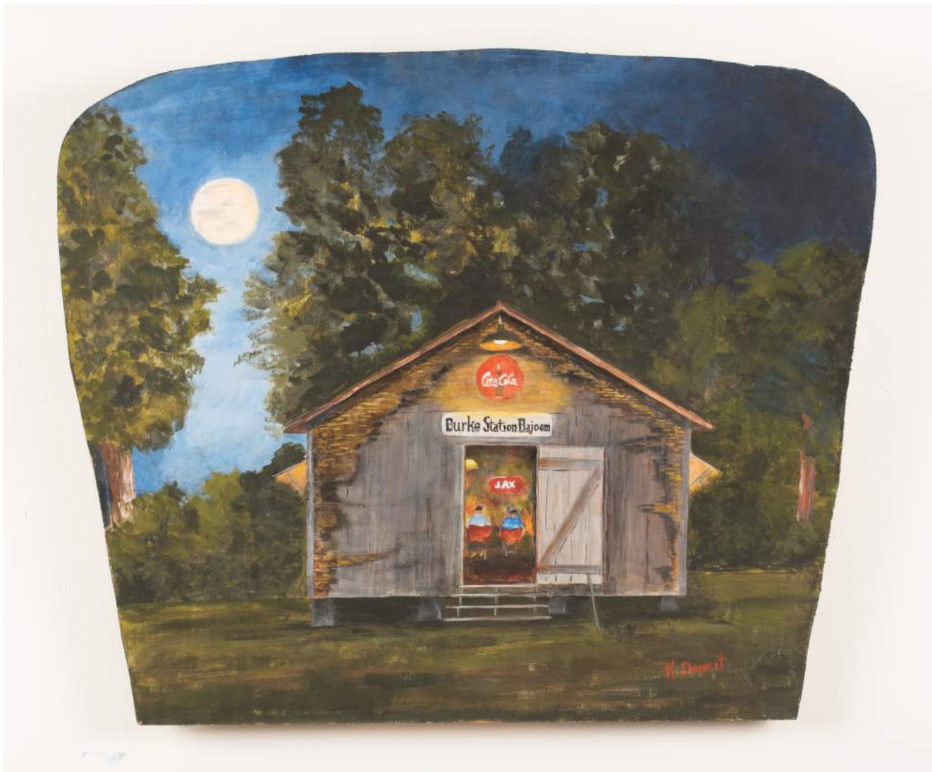
Karen Doumit (born 1948). Untitled (Burke Station Bajoom, Cajun Village) , circa 2000 – 2009.

Acrylic paint on shaped masonite board. 24 1/2 x 29 1/2 in.